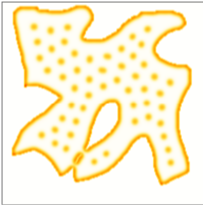
Spot pattern in Gierer-Meinhardt model with irregular domain